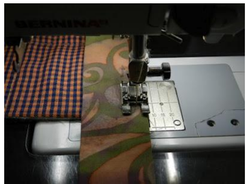
When you get to the end of the first side, stop a quarter of an inch from the edge. Now I know people who measure this but I have done it enough that I know I can eyeball it safely enough. Fold the binding up like this - the fold should be at 45 degrees .....