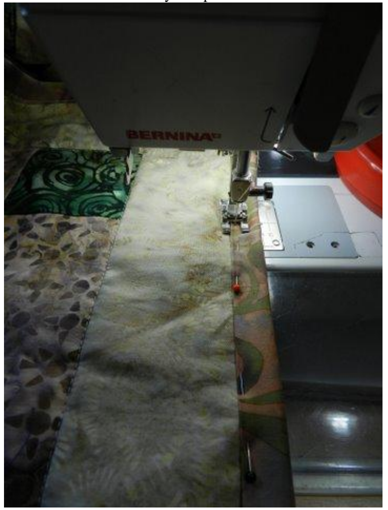
No idea why this pic is so dark!

I pin my binding all the way round (my least favourite part of the whole process) and then stitch as close the edge as you are comfortable doing. I like a straight stitch but you can use a zig zag and you can also use a fancy stitch if you have them. Keep your eyes on other people's blogs and you will see what they do.