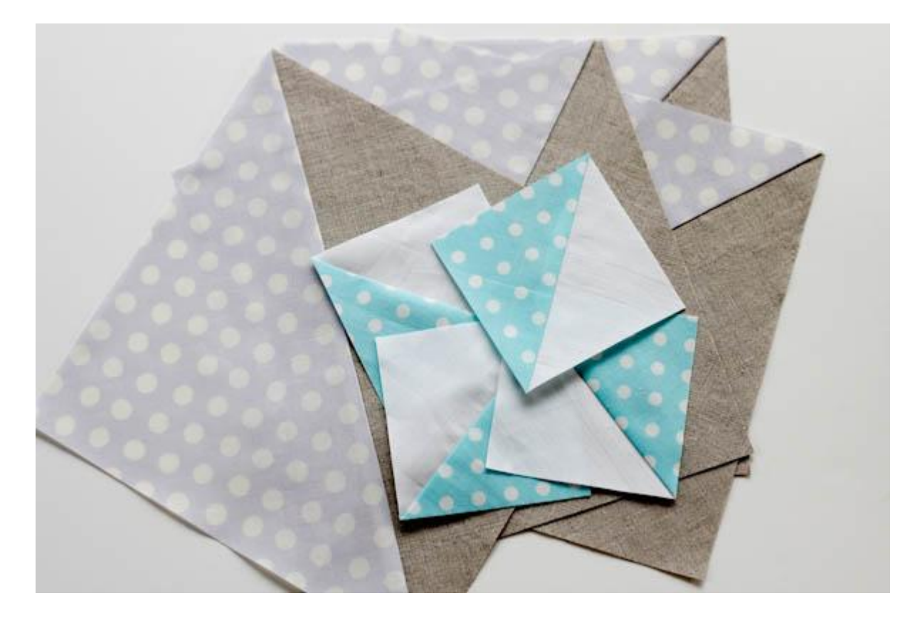
So your math would be this: Beginning Square Size x 0.64 = HST size.

When you open out and iron them you get perfect half square triangles! It's amazing every time. I recently made a bunch of these in different sizes just to get a feel for the math. I have some of the sizes figured out to get you started, but the basic math is a HST that is roughly 64% of the size of your original square.