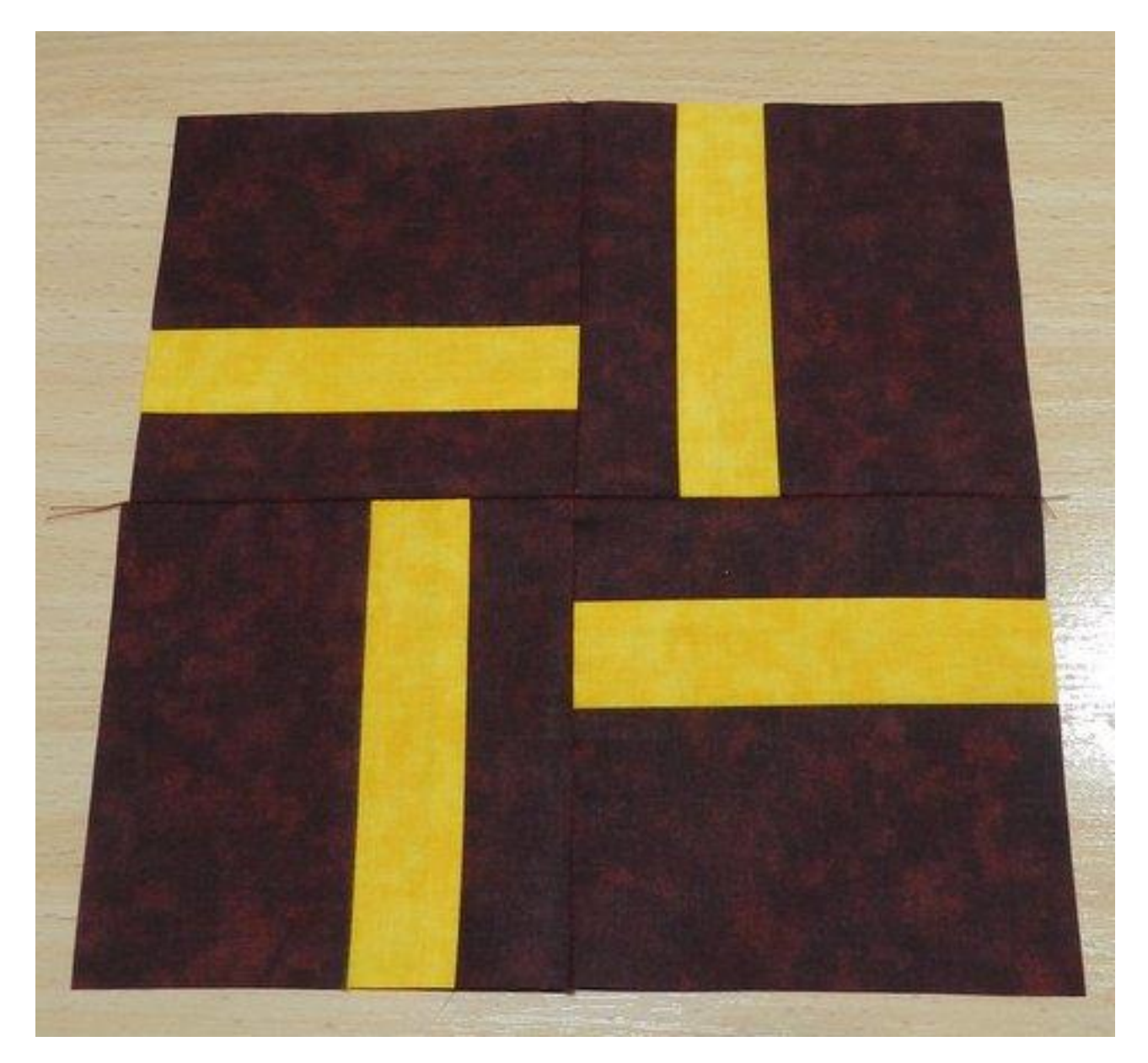
You will need a 4 1/2 inch strip of Maroon across the full width of the fabric

It is simple enough and looks good in two colours. For this month we are going to aim for maroon and gold. No prizes for guessing that I want to knock off some quilts for Maroons Fans and also for Broncos fans. Those two teams are the most popularly requested teams and i have lots of requests for them at the moment. Please can you help me know some off the list.