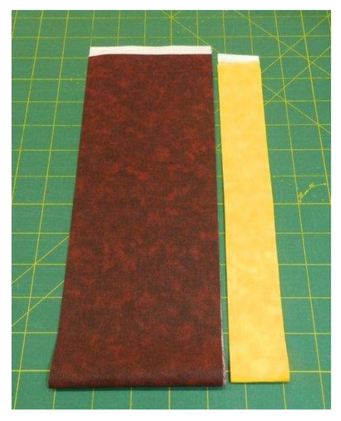
Next cut a 1 1/2 inch strip off the maroon.