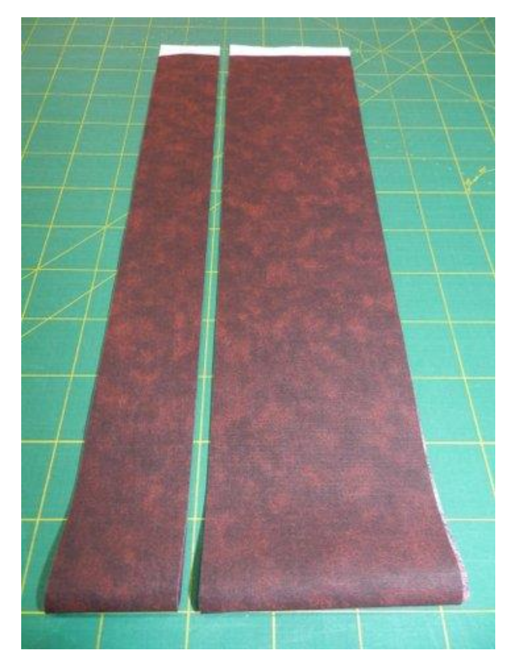
Join the strips together like so..... and press the seams however you think appropriate. I pressed mine in one direction.