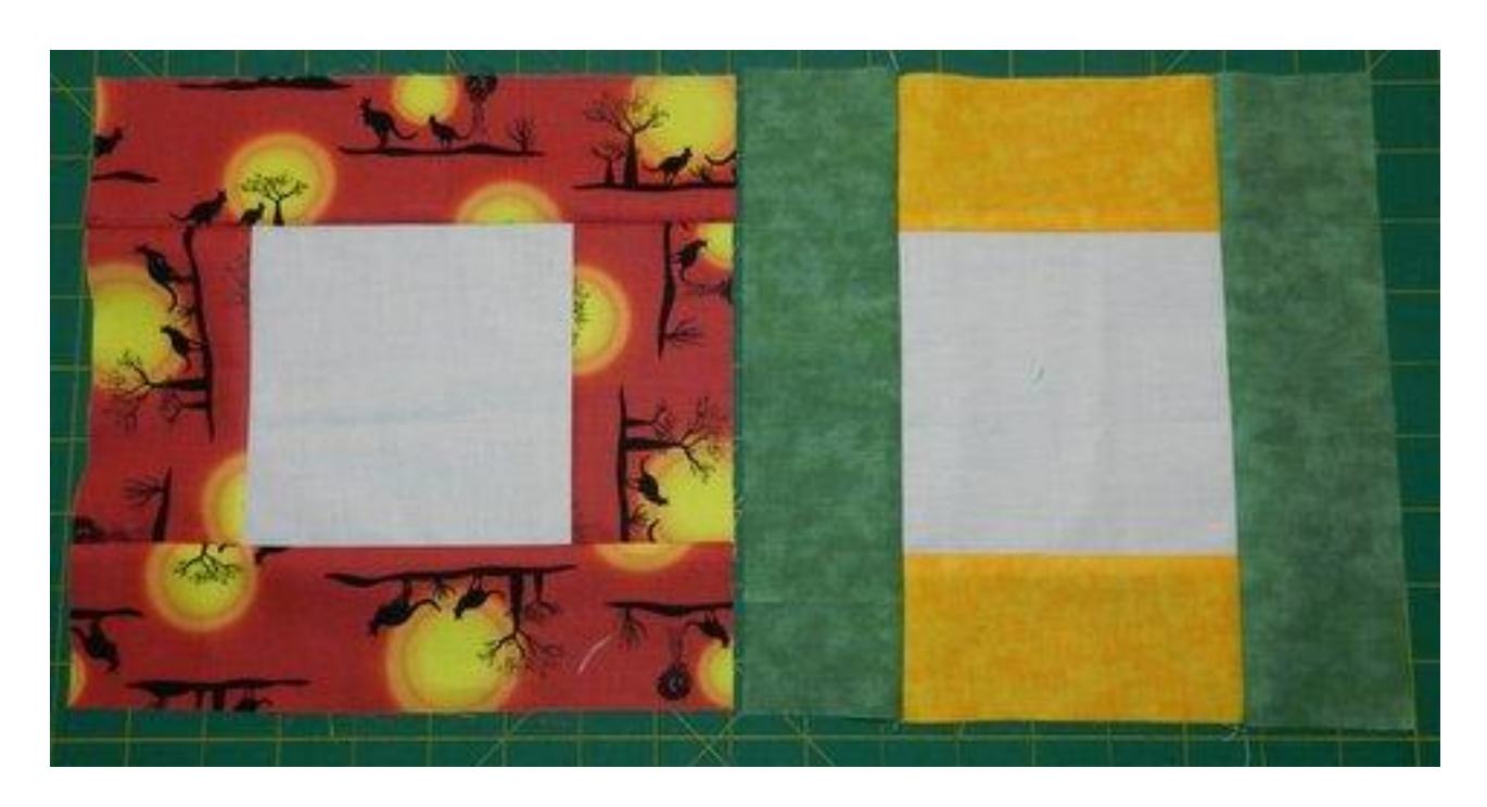
For the Aussie Pride Blocks....

Quite simply cut a background piece 9 inches square in either Green or Gold - please stick to some shade of these colours. Then choose your Aussie design to add and applique away. Feel free to sign your block if you wish. Either a subtle signature somewhere on the block or with a message. I chose to do a roo and a map of Australia. You can do whatever you like..... there are lots of Aussie animals or even Aussie words. You can use a small close zigzag or you can use button hole stitch. You can even do it by hand if you are so inclined.