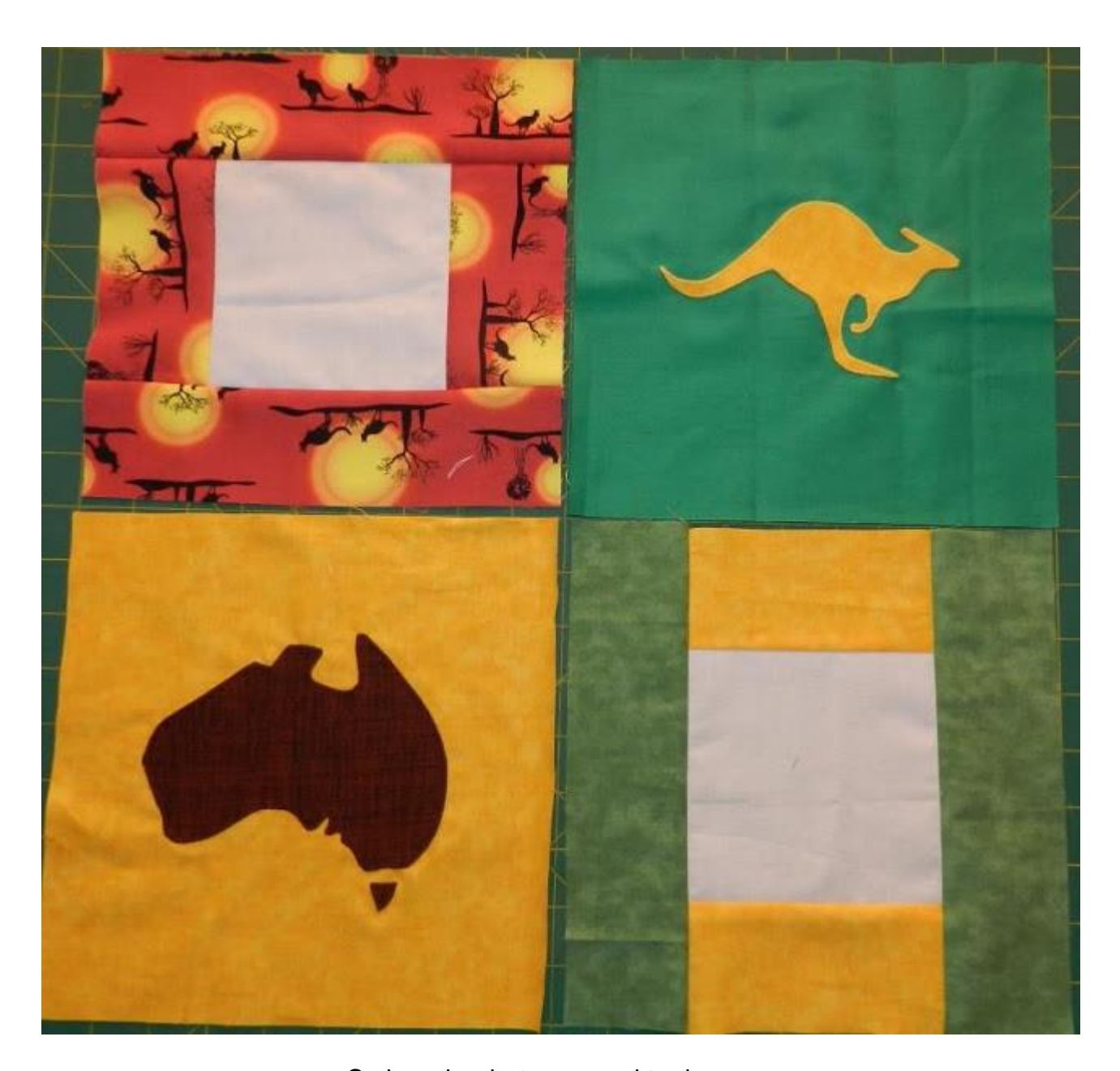
So here is what you need to do.