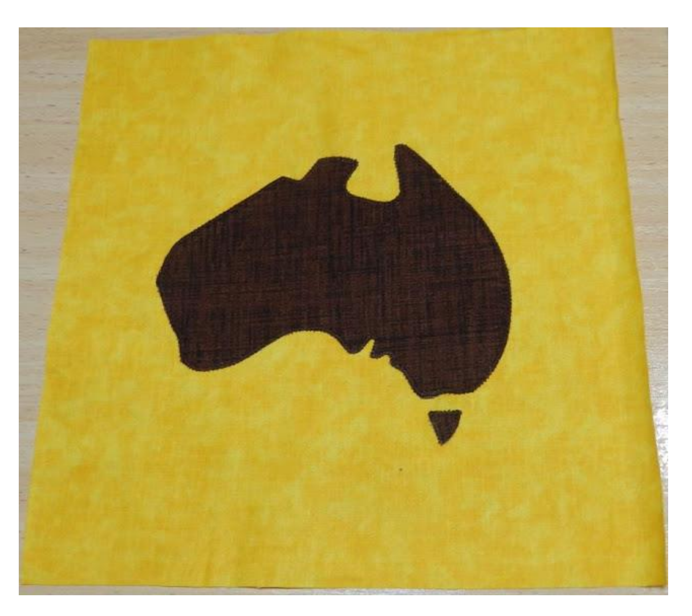
Feel free to make just a signature block or just an Aussie Pride block or a few of each. It is entirely up to you.