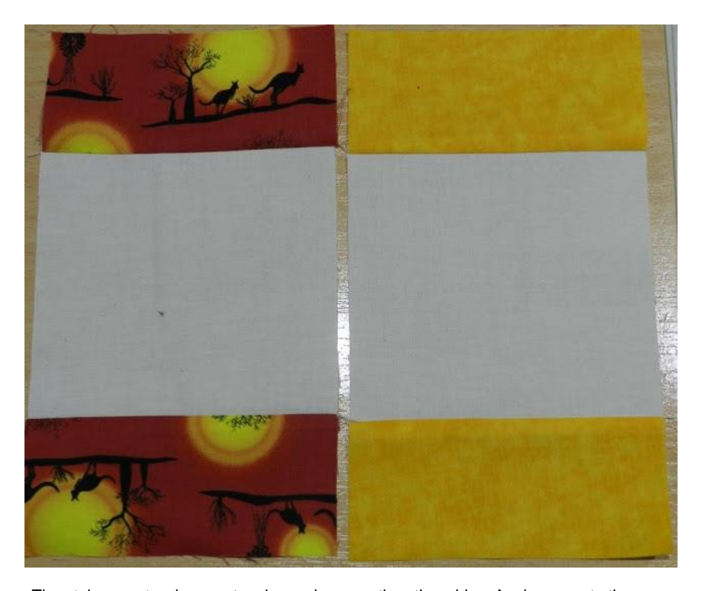
Then take your two long rectangles and sew on the other sides. Again, press to the coloured fabric. Your block will look like this.