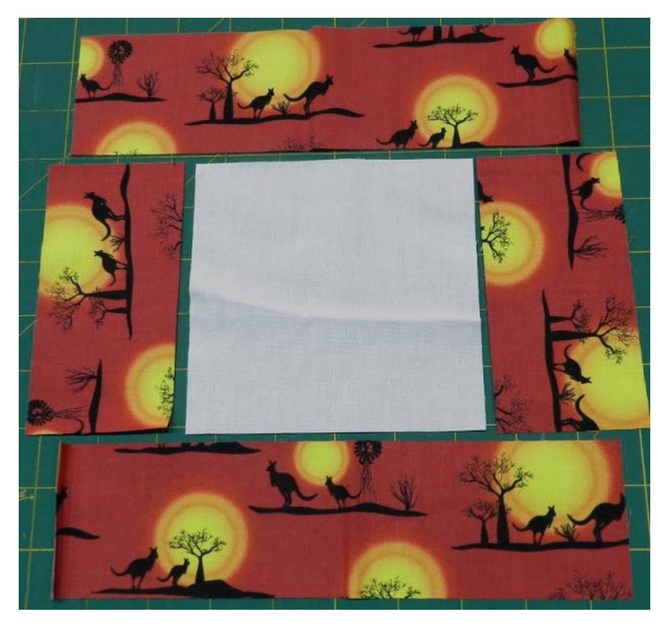
Please note - it is important that you use a 1/4inch seam or all the blocks will end up different sizes. If you do not have a 1/4 inch foot the sew a seam, measure it and adjust accordingly. It really does make a difference.

Sew your two short rectangles to either end of the five inch square. Press toward the coloured fabric. This is what you will have.