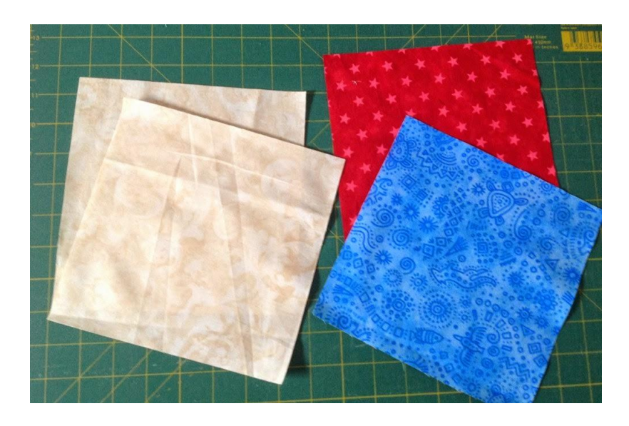
2) Arrange you blocks as I have shown below.