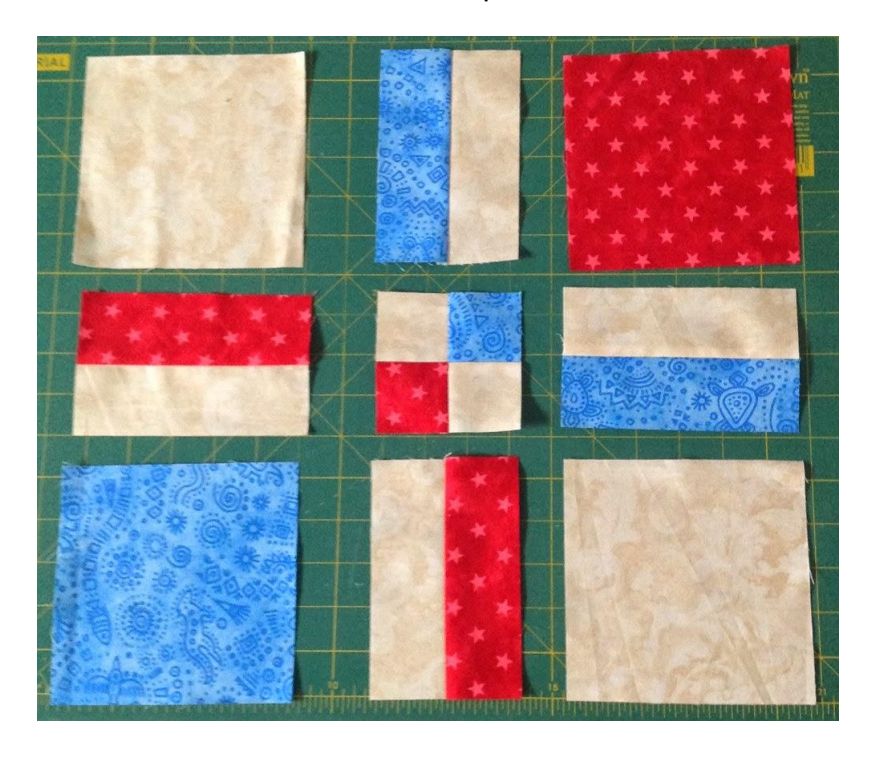
7) Sew each of your new rows together.

6) Re-arrange the cut pieces so that they look like my picture below. So what you do it move the striped rectangles to be in the opposite position they were in originally. Rotate the centre square.