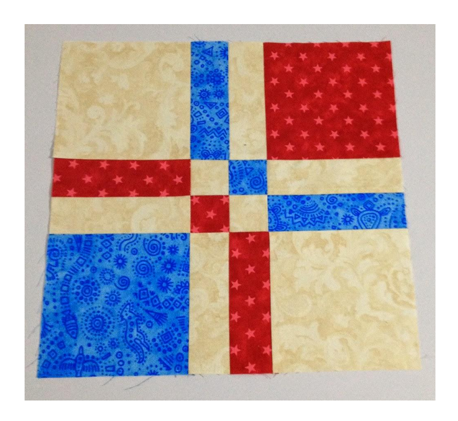
Ok so here we go.

So there are a few rules for the ones we are going to make. NO OBVIOUS FLORALS, NO PINKS OR PURPLES, NO GIRLY FABRIC. Sorry to be so harsh but we have plenty of quilts for girls on hand and we really need to have blocks to make more blokey quilts. For each block you will need two separate colours and also a cream, beige, taupe or light tan (what ever you have that is closest to my finished block is fine). The reason we ask for everyone to use the same secondary colour is so that they will all blend together when we make up some quilt tops.