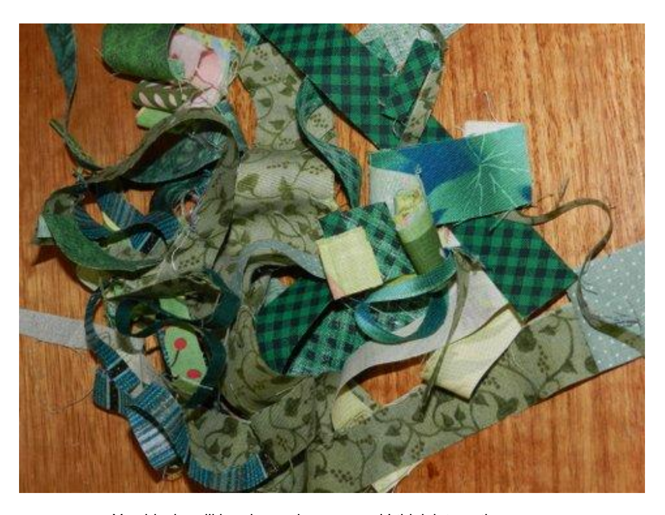
You blocks will be nice and square and I think interesting.