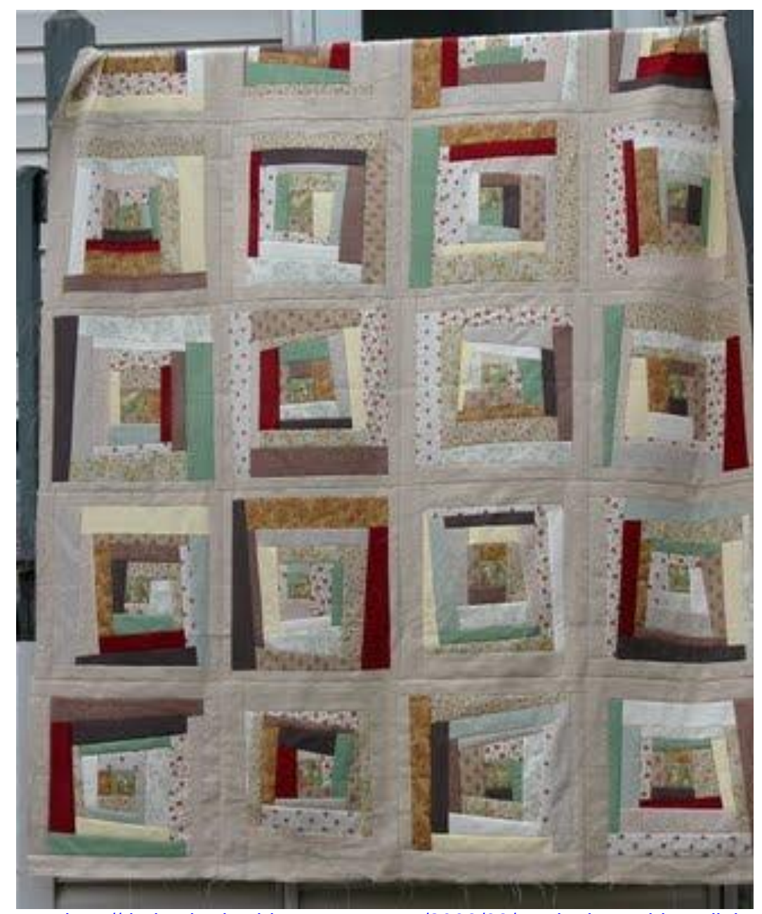
source <a href="http://duringtheday.blogspot.com.au/2009/09/wonky-log-cabin-quilt.html">http://duringtheday.blogspot.com.au/2009/09/wonky-log-cabin-quilt.html</a>