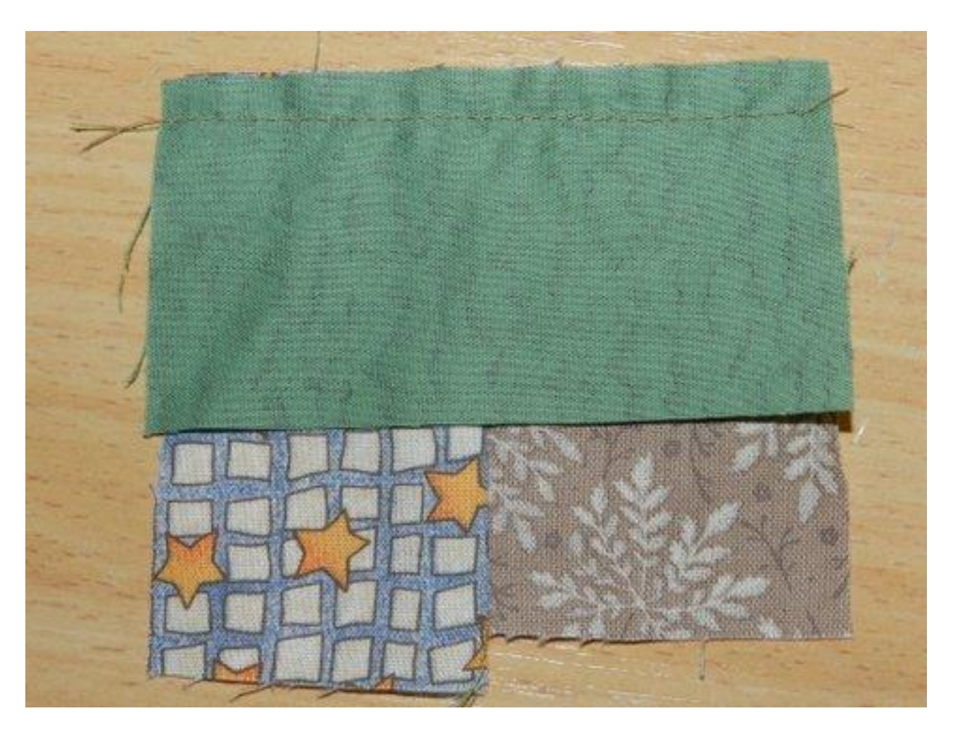
Next the pearly cream fabric - trim off the untidy bits each stage and clip your threads. Makes for a much tidier block. And don't forget to press each step too please.