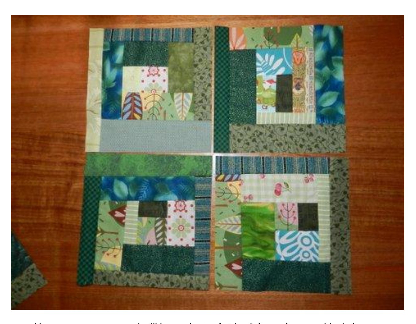
Hmmm as you can see I still have plenty of strips leftover for more blocks!