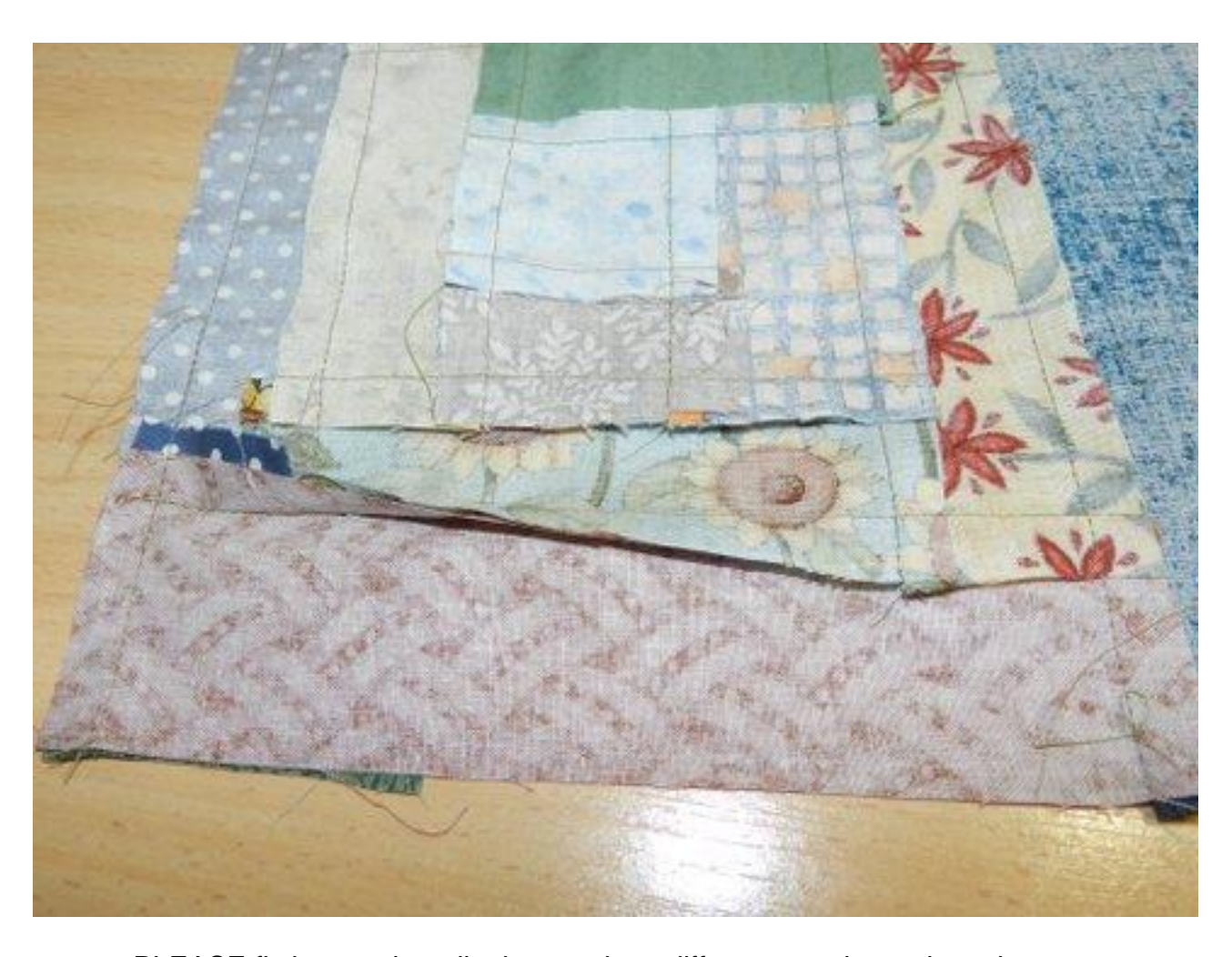
PLEASE fix it now. it really does make a difference to the end result.