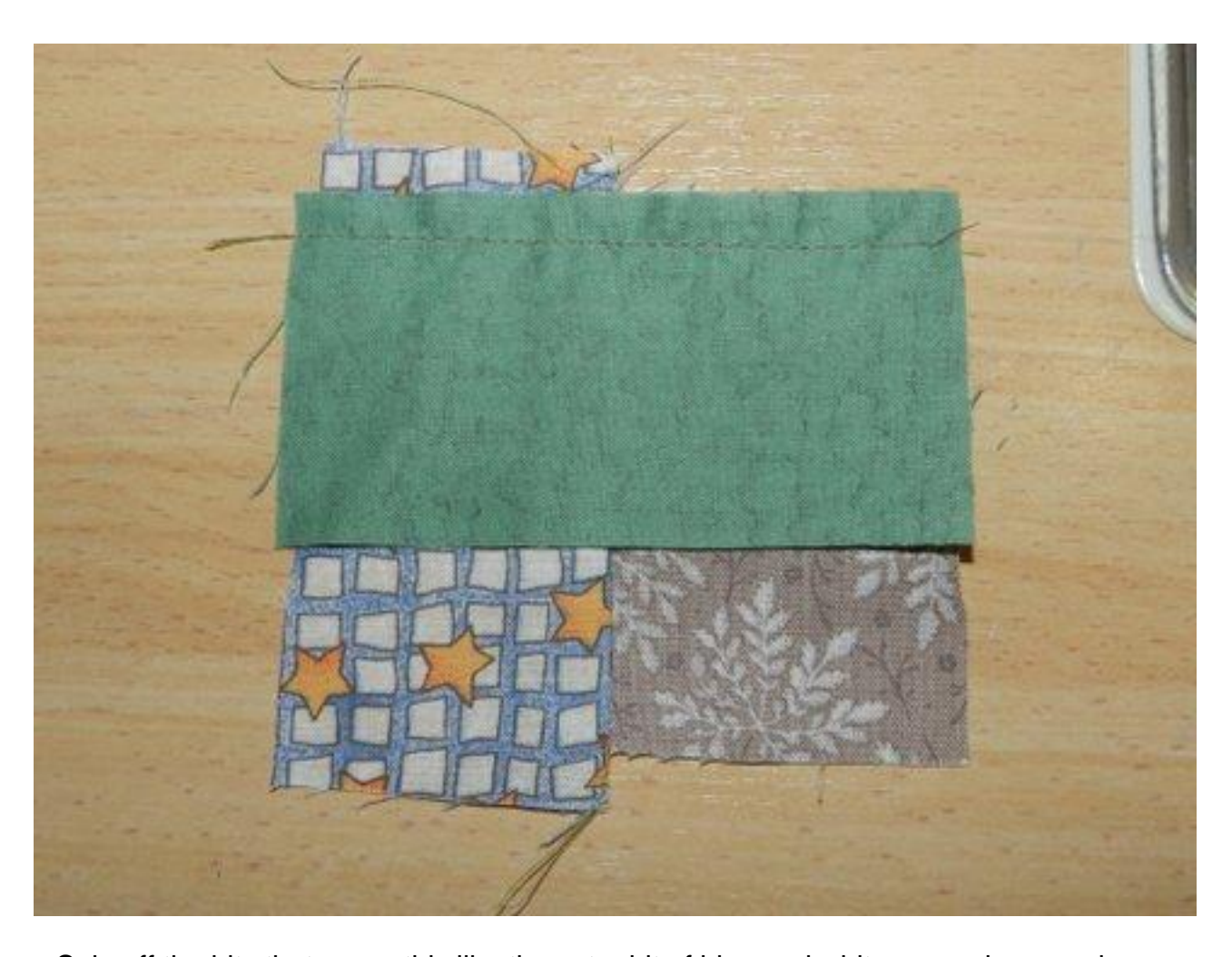
Snip off the bits that are untidy like the extra bit of blue and white - see above and below.