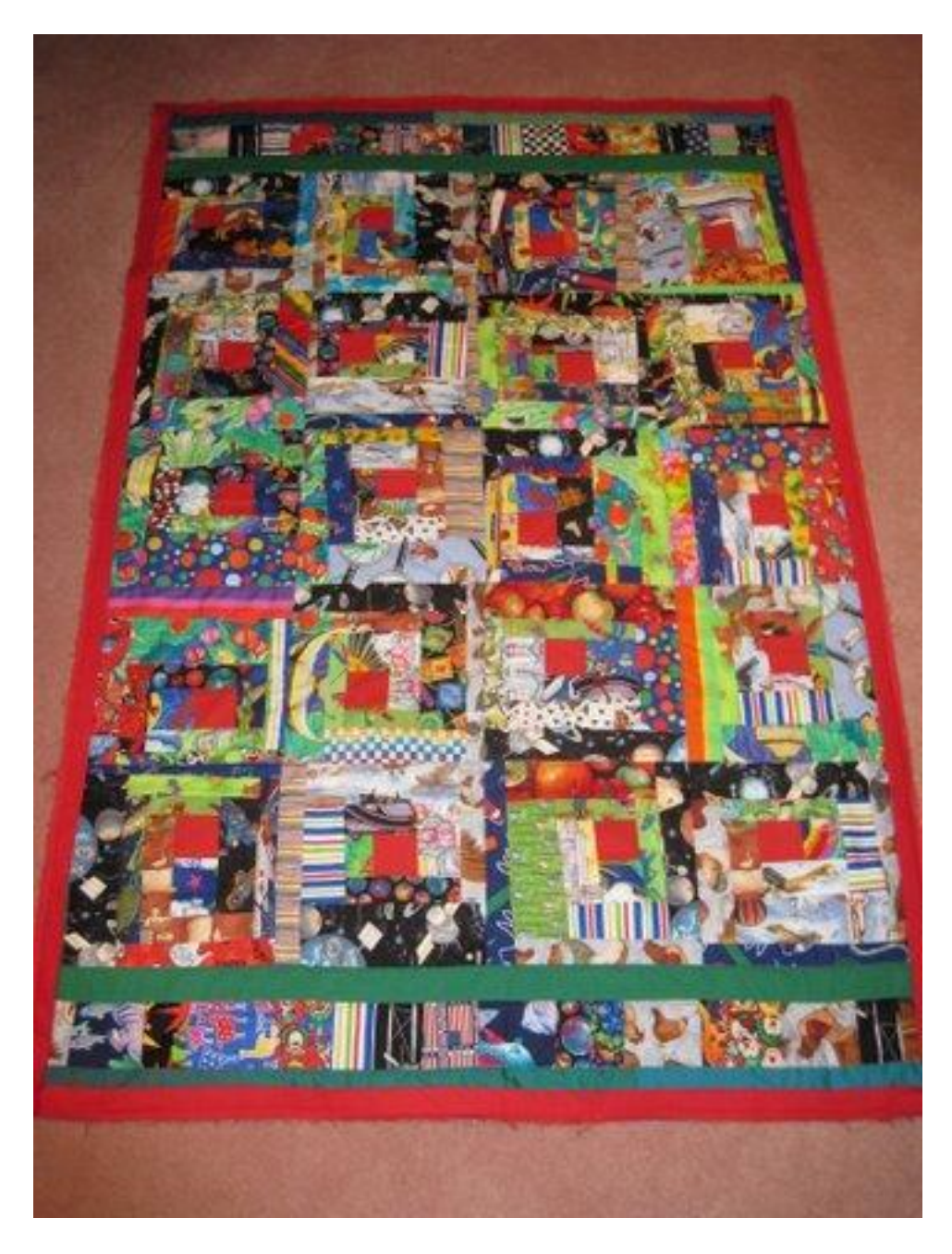
This is another nice one I found on line. Again the blocks were cut askew - we are not doing that please but it does look great.