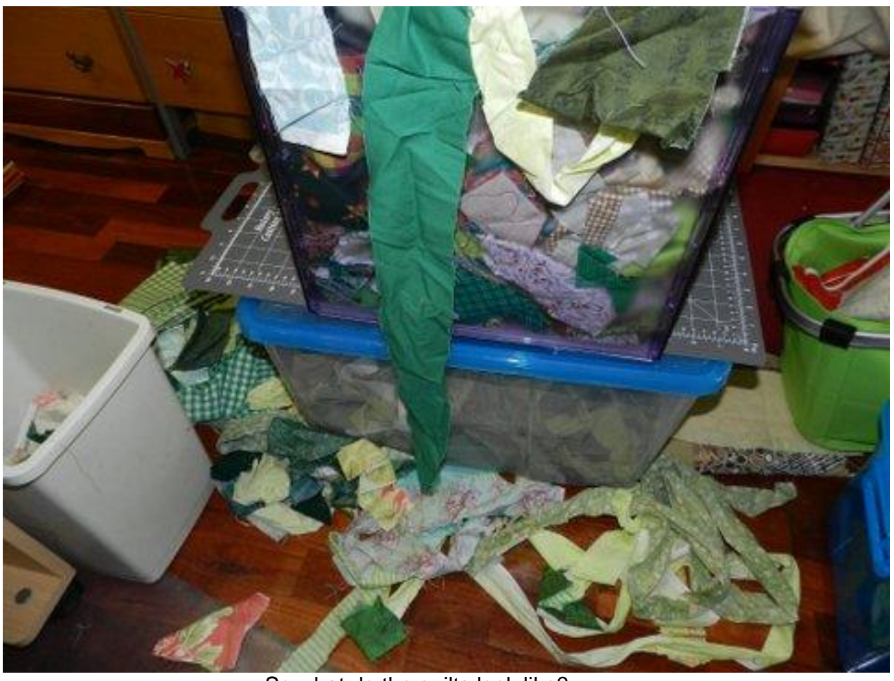
So what do the quilts look like?

Well here is one I made a couple of years ago and sold as part of an on-line auction for the QLD floods and it is now living in Michegan. I made these blocks a bit bigger than they needed to be any cut them on an angle. I love the way the quilt turned out but OH THOSE BIAS EDGES. Not sure I will do that again.