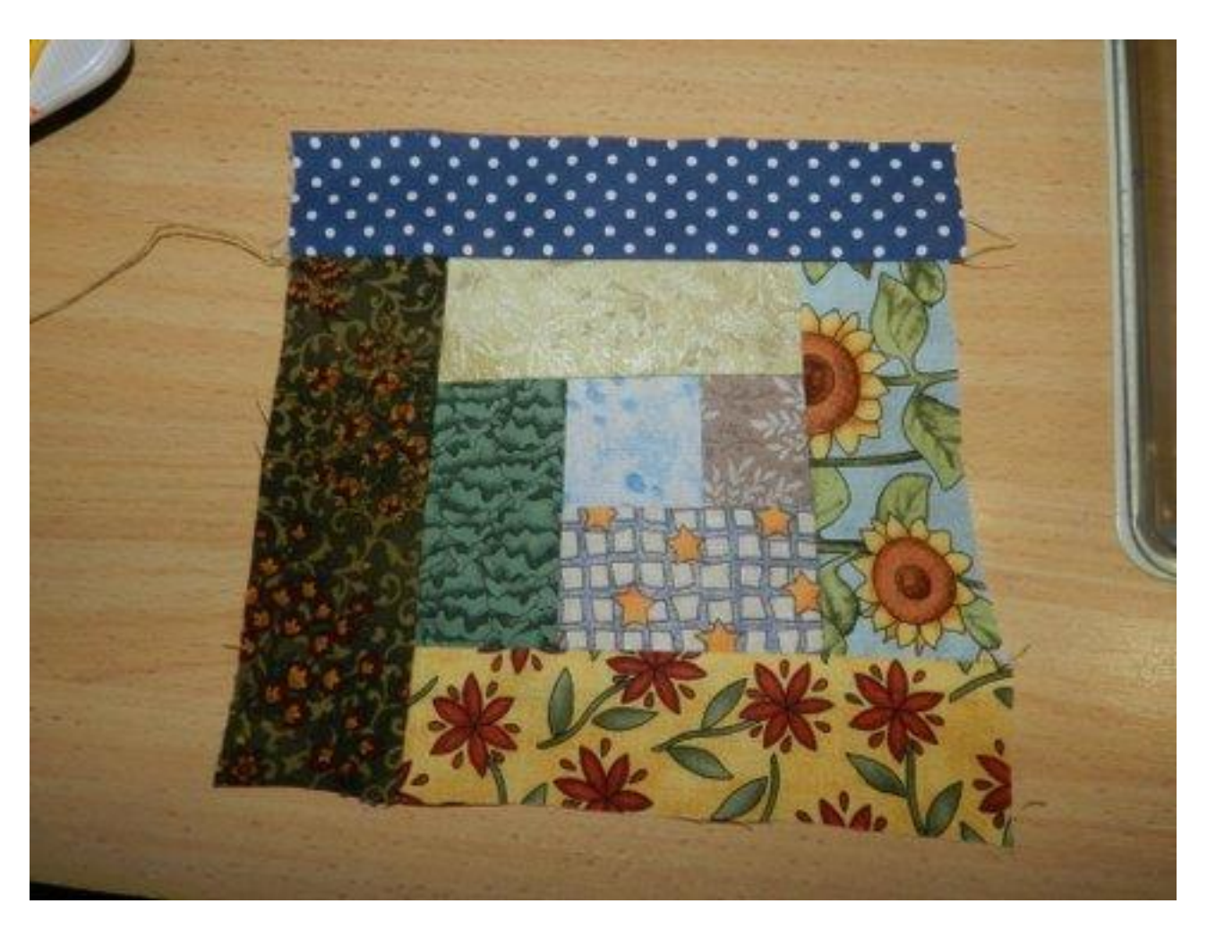
Now here is an important point. PLEASE if you turn your block over and find one of the seams has not been stitched the way it is supposed to