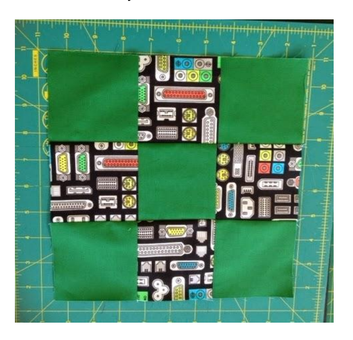
You will need:

So this is what your final block will look like.