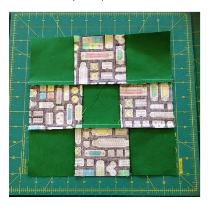
That's it all done.

Join the third row in the same way then press the two seams in the one direction.