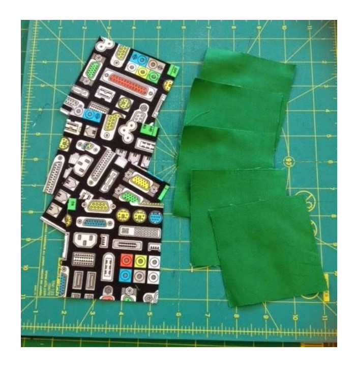
Layout your squares into three rows of three squares, alternating from solid to patterned.