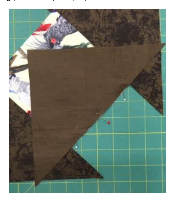
Repeat the process for the last triangle.

Before pressing the last two seams, lay the block on the cutting board and cut off the excess triangles as shown.