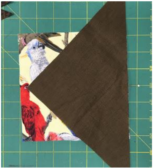
Repeat for the opposite side of the square.

I have pressed mine onto the main fabric as this will make the main diamond push forward.