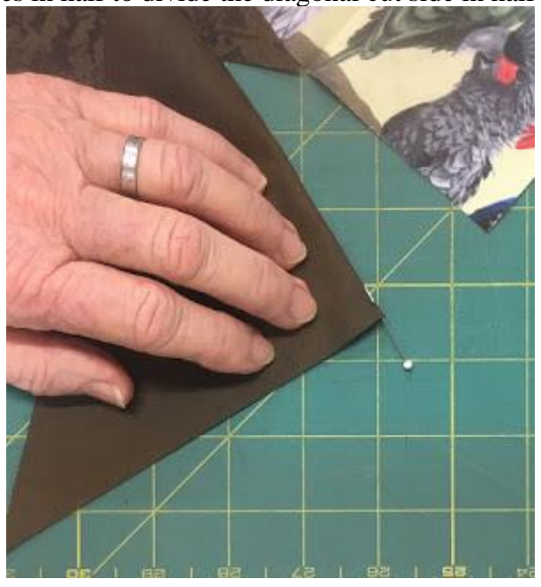
Repeat for all four triangles

Fold the four triangles in half to divide the diagonal cut side in half and mark with a pin