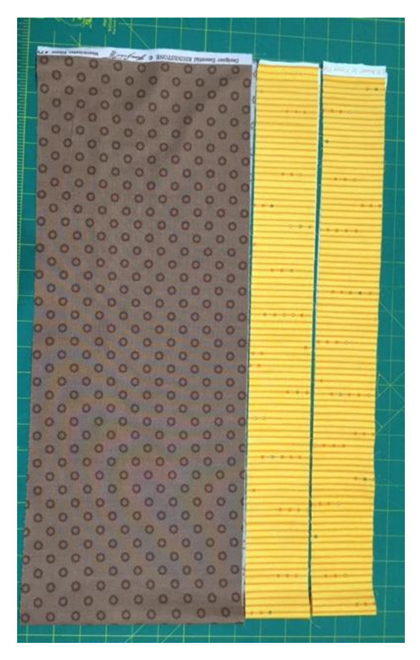
Take your wide piece, in my case the brown piece, and cut a 2 1/2 inch strip on the long side.