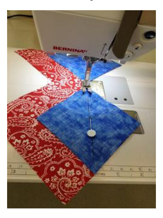
Like so !